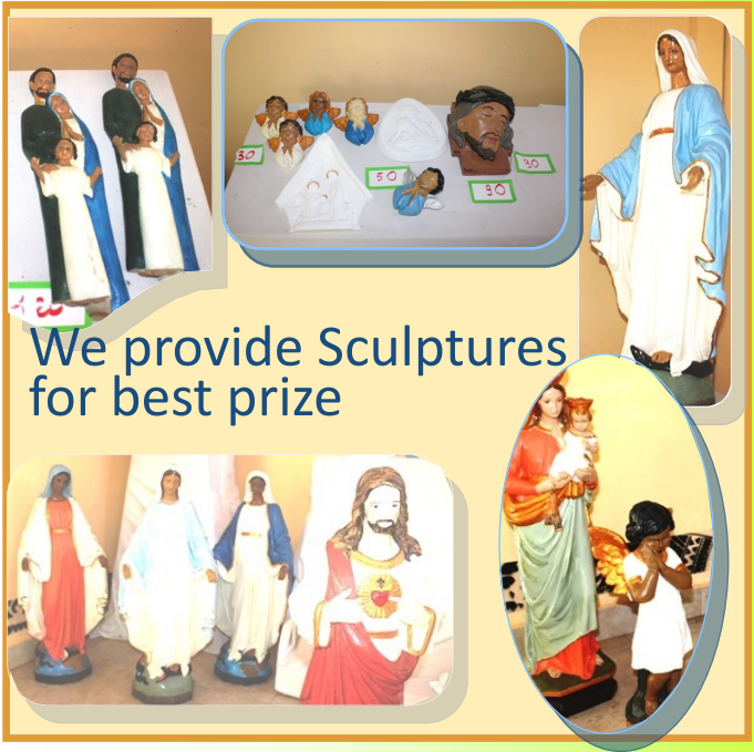
The Waves Newsletter Catholic Diocese of Gizo.